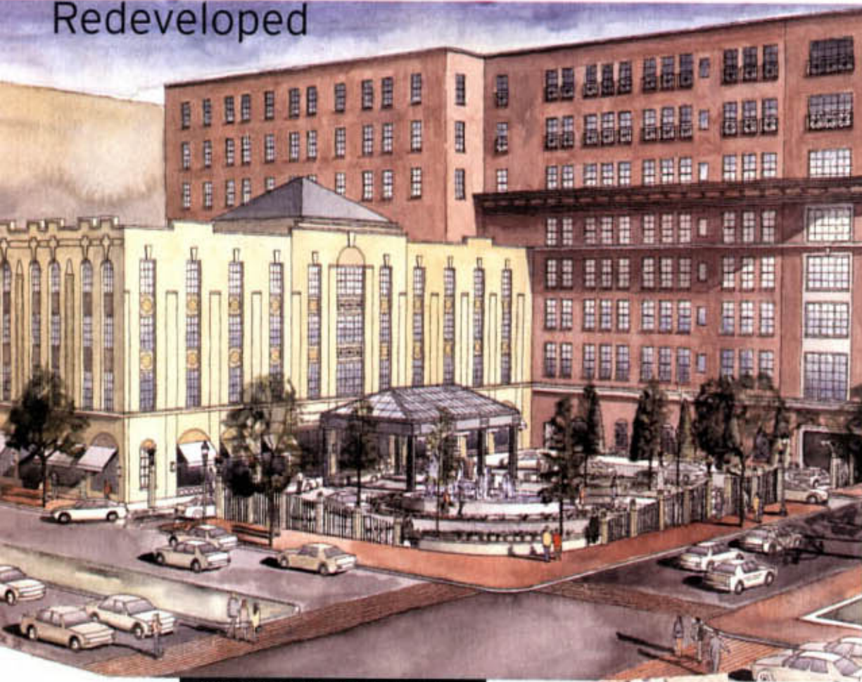
HOTEL MILLER & RHOADS, 5TH & BROAD VIEW