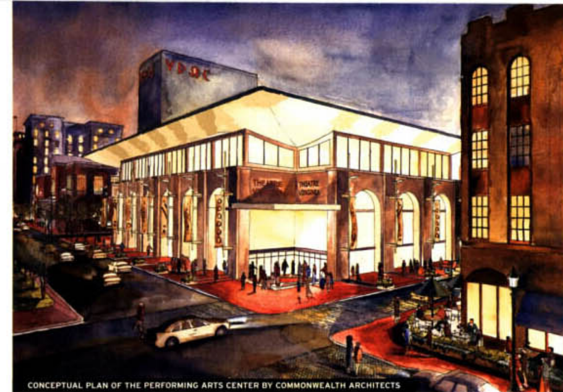
CONCEPTUAL PLAN OF THE PERFORMING ARTS CENTER BY COMMONWEALTH ARCHITECTS

When all of the Broad Street elements become a reality over the next five years, including the Performing Arts Center, Federal Courts building, and related developments in Jackson Ward, the transformation of the Broad Street/convention center area will be complete.