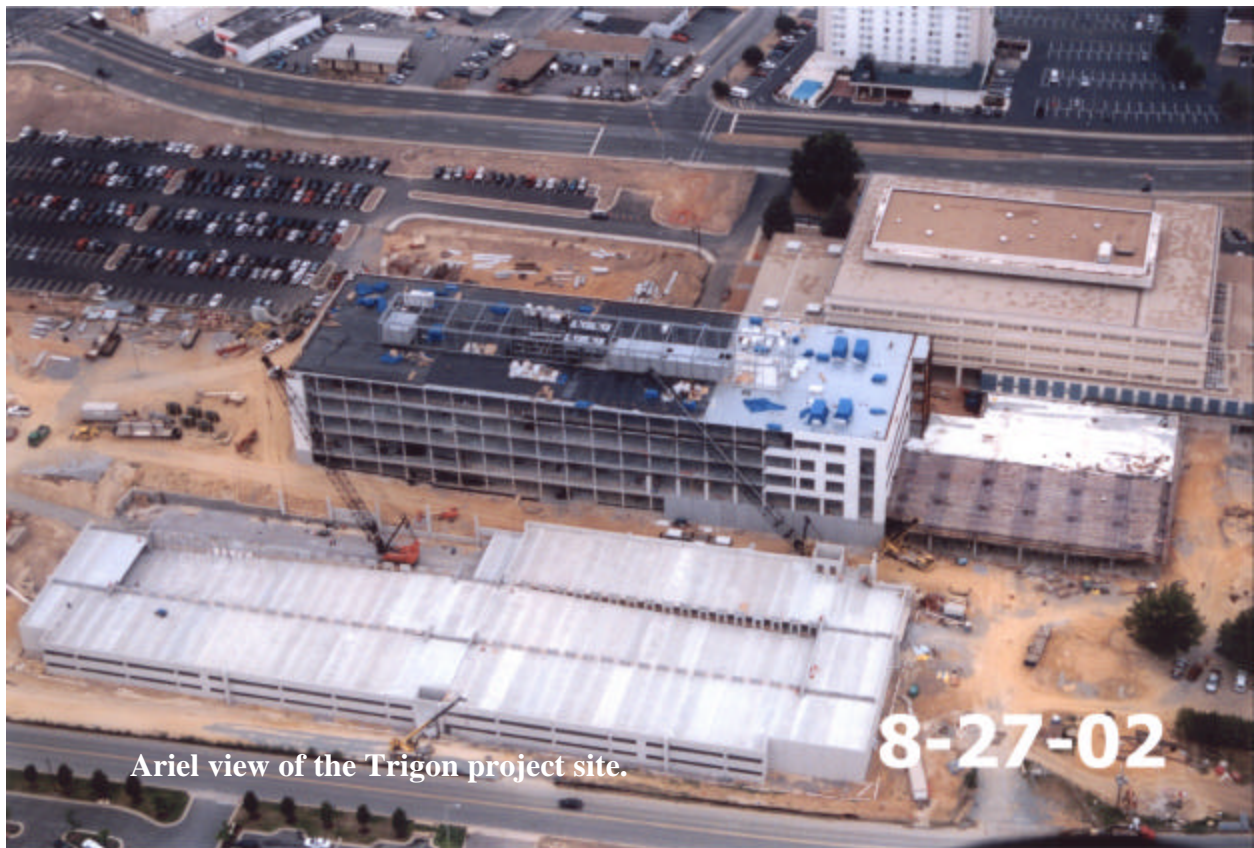
Ariel view of the Trigon project site.