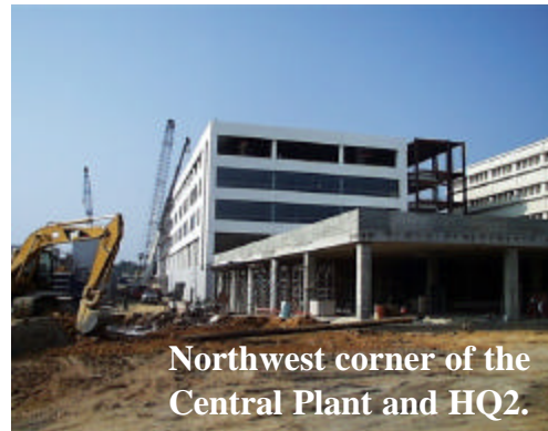
Northwest corner of the Central Plant and HQ2.