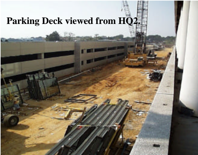
Parking Deck viewed from HQ2.