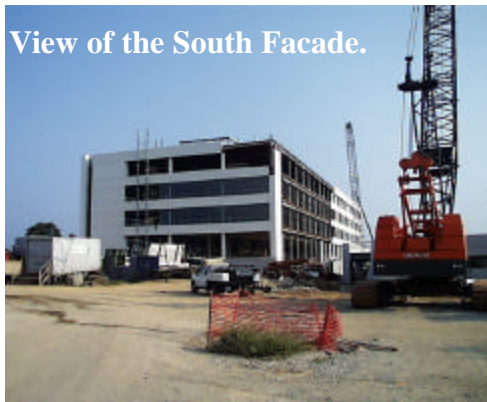
View of the South Facade.