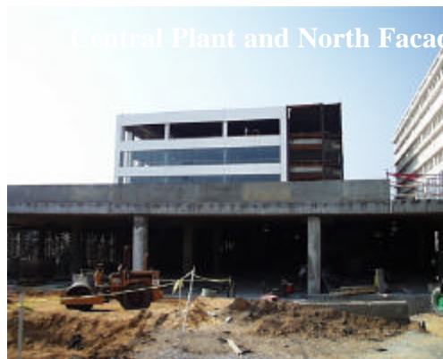
Central Plant and North Facade