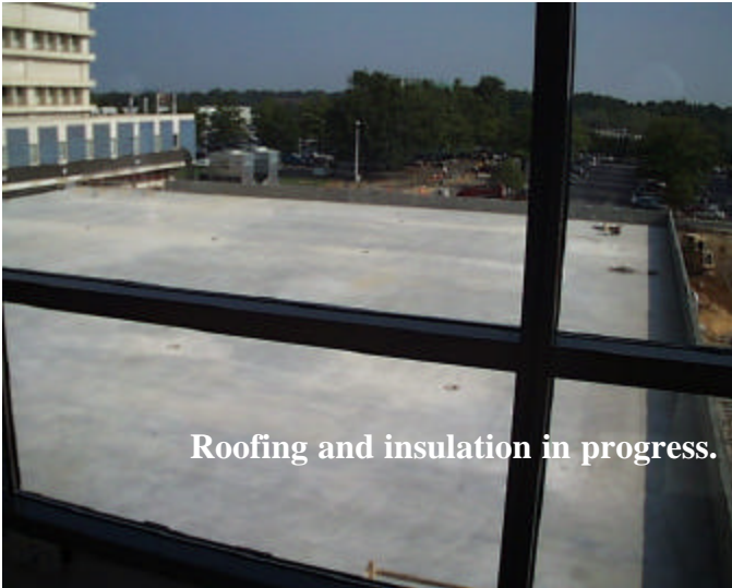
Roofing and insulation in progress.