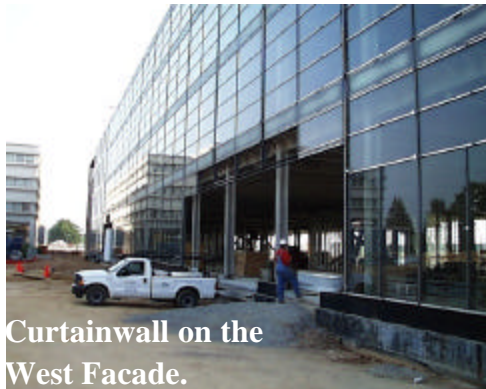
Curtainwall on the West Facade.